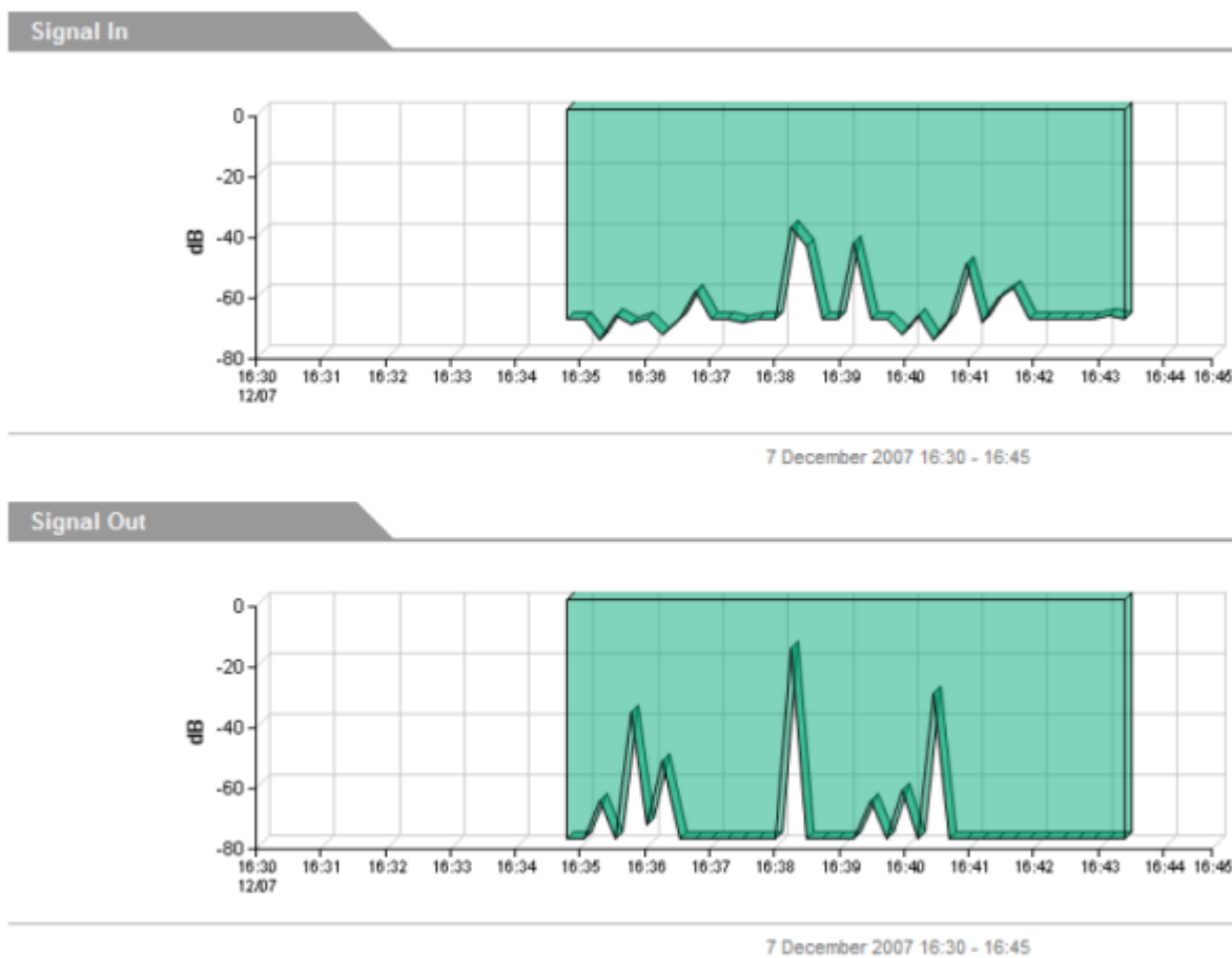
Figure 3. Signal In and Signal Out metrics are useful for tuning an echo canceller.

Cisco System's typical echo testing procedures expect you to gather these metrics by frequently running a command from the command-line interface during an active phone call. Now you can simply start a UC Monitor Call Watch for a phone connected to the gateway under test, make a phone call to the PSTN to or from that phone, and take a look at the metrics as they are reported in real time. The signal levels are presented in a graph format that is continually updated during the tuning procedure.